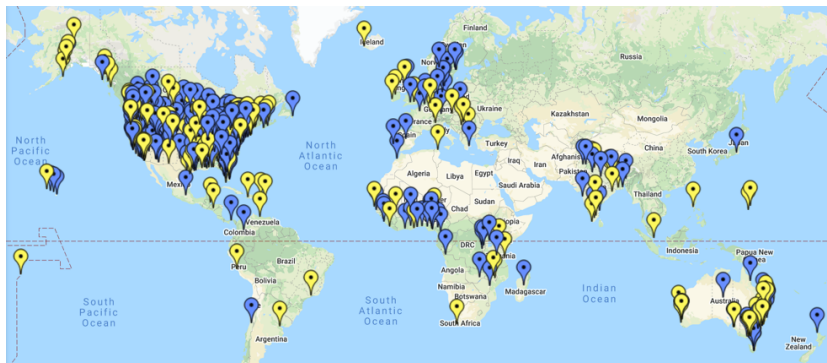
Figure 1: CCL chapters as of 2021

Citizens' Climate Lobby UK (CCL UK) is the UK branch of Citizens' Climate Lobby (CCL), a global, non-partisan organisation that advocates for Climate Income, a policy also known as Carbon Fee and Dividend. CCL is composed almost entirely of volunteer citizen lobbyists. CCL was founded in 2007 in the US and has a governing board with renowned economists and scientists. Ultimately, this led to the introduction of the Energy Innovation and Carbon Dividend Act bill to the US House of Representatives.